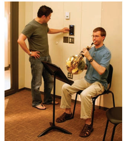
PRACTICE ROOM WITH VAE® TECHNOLOGY

When practice room alternatives were first considered, VAE technology was not the highest priority. “But in the end, it tipped the scales in Wenger’s favor in a very, very tight bidding process,” Meissner claims. “Wenger