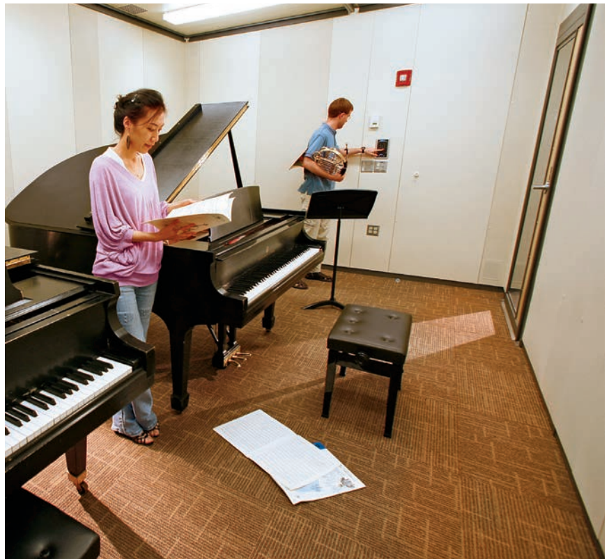
ALL OF THE NEW SOUND-ISOLATING PRACTICE ROOMS ACCOMMODATE AT LEAST A TRIO OR QUARTET. MANY ARE LARGE ENOUGH FOR GRAND PIANOS.

Hains also praises Wenger’s ability to provide rooms of various sizes and heights while even accommodating changes late in the process.