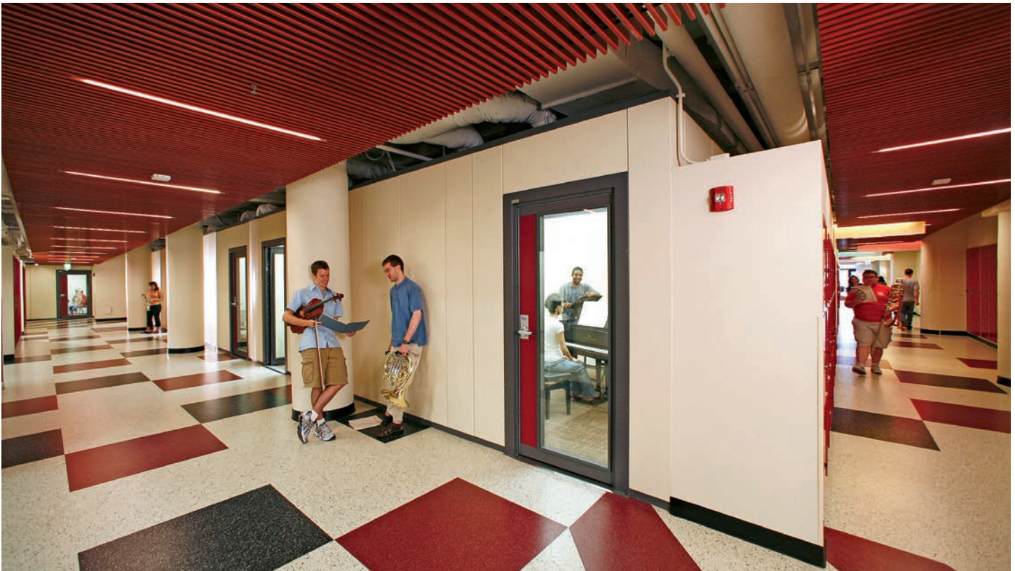
WENGER PERFORMED ON-SITE ACOUSTICAL TESTING TO ENSURE ALL PRACTICE ROOMS WOULD MEET SPECIFIC SOUND-ISOLATION CRITERIA.

schedule and make the project a bust,” he states.